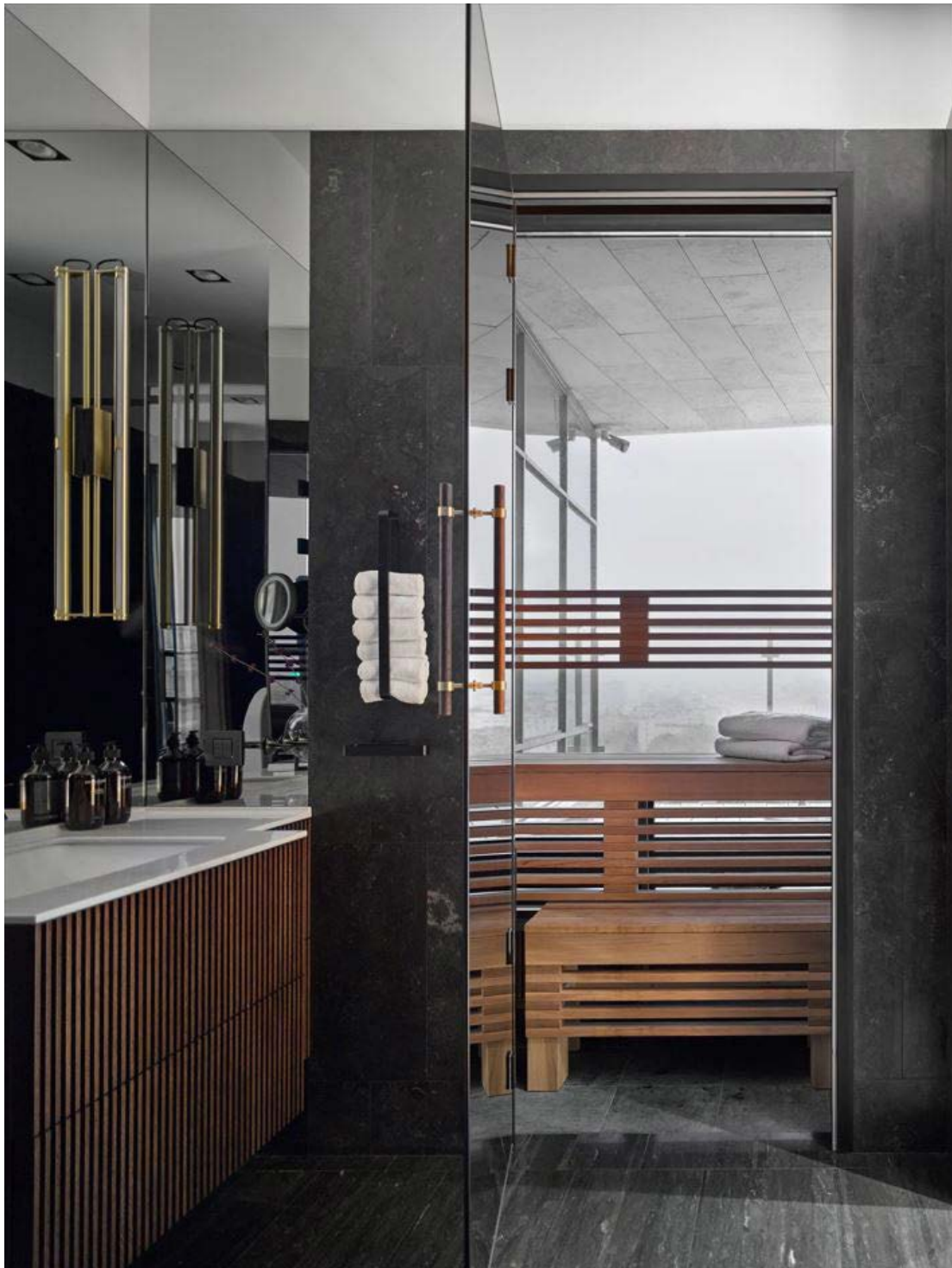
Sauna with Smokehouse equipment got a huge window and a view of the city. Stone, Salvatori.