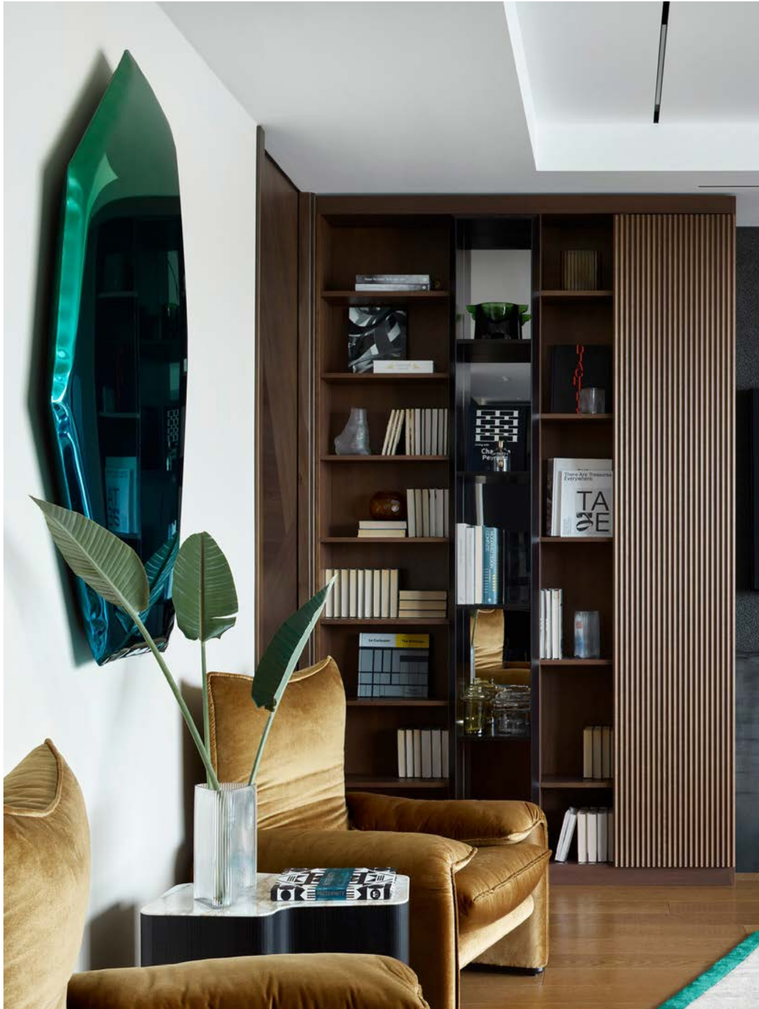
Living room piece. Maralunga armchairs, Cassina; Lou coffee table, Minotti; on the wall, Zieta; built-in shelving made by Loftmark; built-in light, Delta Light; floor, Finex.

The good and the bad were about evenly divided. It was a concrete box, without interior load-bearing walls, but with a large ventilation shaft in the middle. Victoria played it safe. "The shaft separated the sleeping area of the owners from the rest of the area. But in order to do this we had to move the front door," explains the designer.