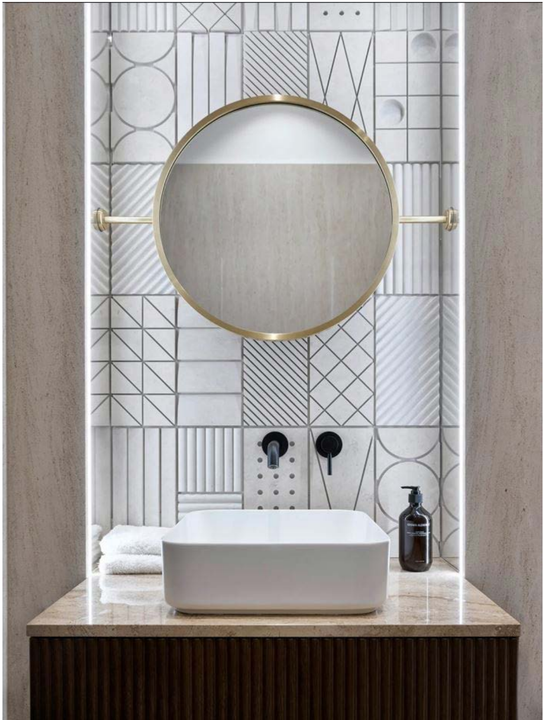
The walls are made of limestone; the panel in marble, Lithea; the brass framed mirror is made by Artvivo; the sink, Cielo; the faucet, Fantini; the cabinet under the sink is custom made, Loftmark.

However, some parallels with the picture outside the window can still be found: the outlines of the Russian Army Theatre are echoed by the angular shape of Edra sofas, which Victoria has supported with custom-made asymmetric carpet and a metal panel on the wall in the living room. The owners of the apartment are among the lucky few who can appreciate the idea of architects Alabyan and Simbirtsev to build a star-shaped theater on Suvorov Square: you can hardly see it from below, but it is perfect from here.