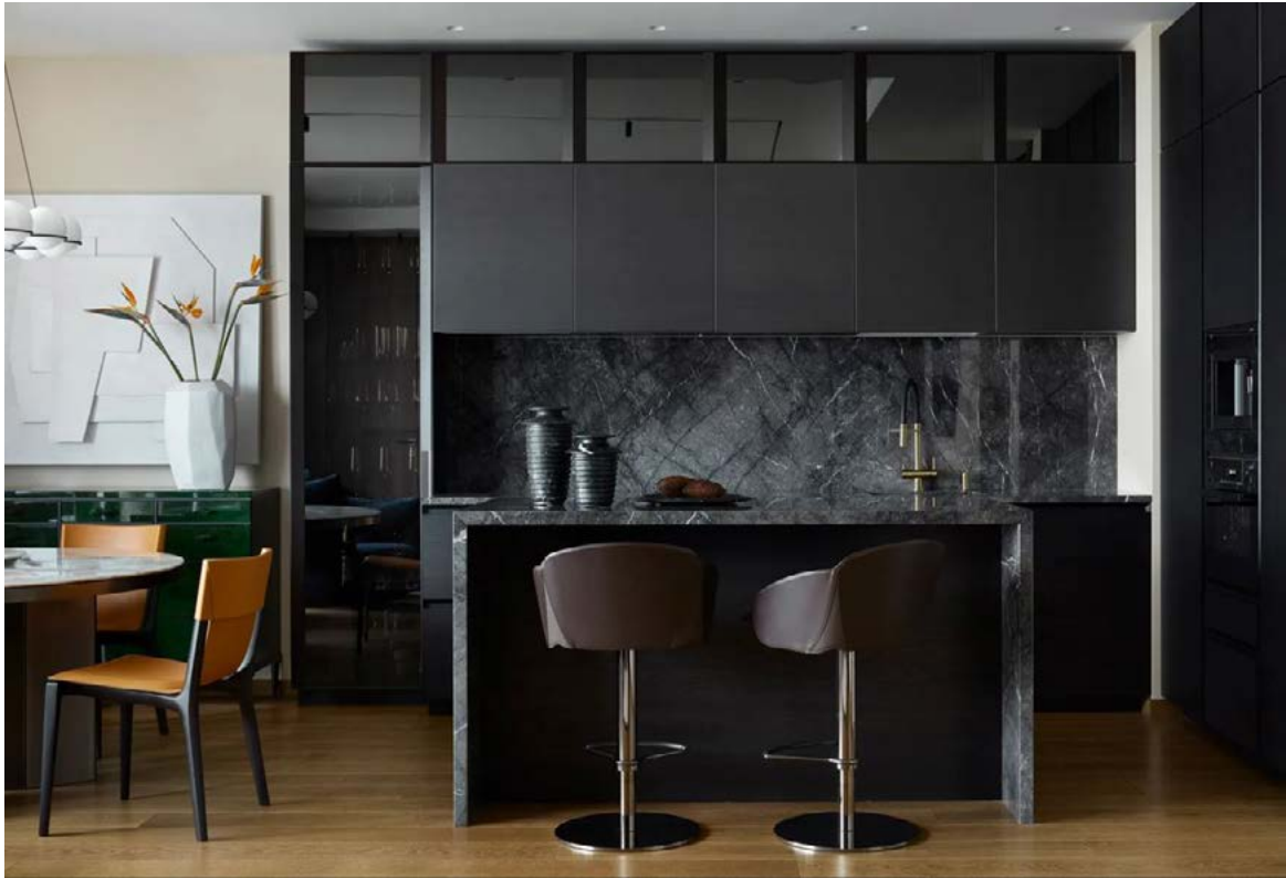
Kitchen with island, Poliform; decorative objects from Altagamma Salon