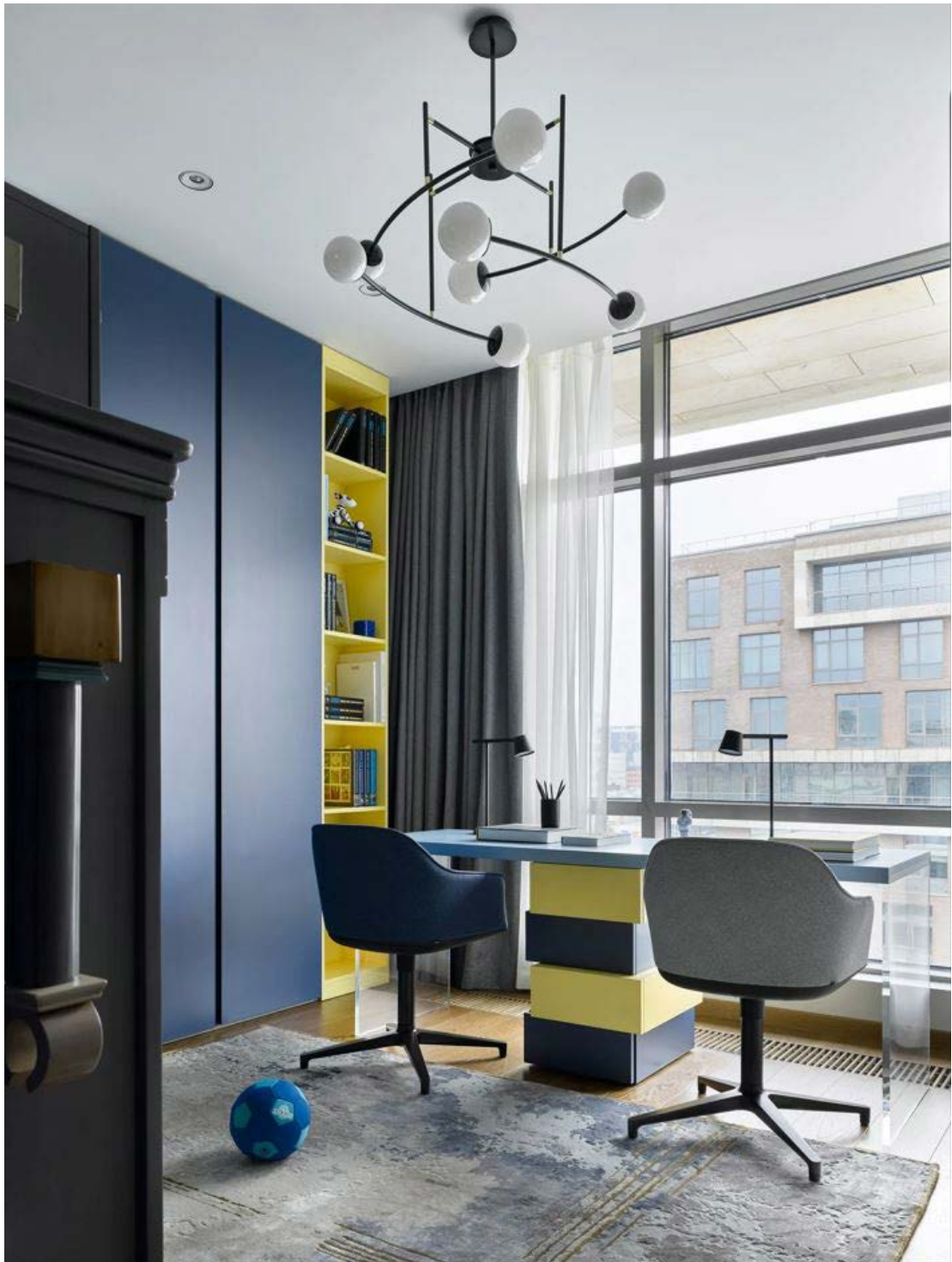
Built-in cabinet and table made to order at Loftmark; armchairs, Vitra; chandelier, MM Lampadari; recessed light, Delta Light.