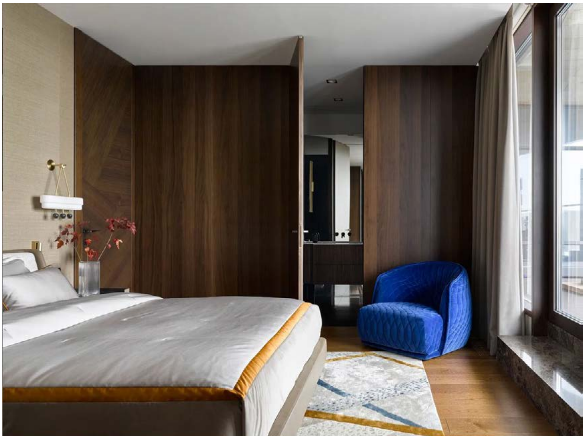
In the bedroom, bed, Minotti; doors and wall panels, Ghizzi & Benatti; armchair, Moroso; custom rug made in Tapis Rouge; sconces, Bert Frank; sisal wallpaper, Nobilis.