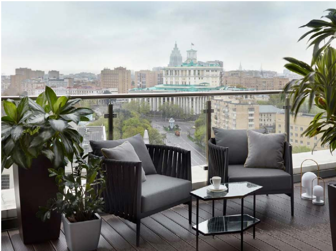
On the terrace, outdoor furniture, Altezza Outdoor, and light fixtures, Marset.