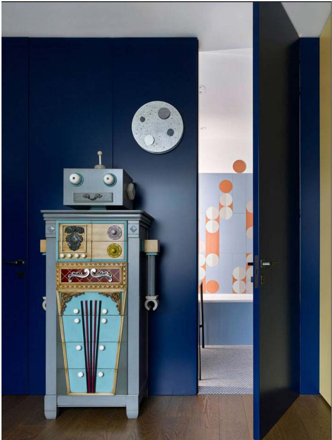
In the nursery, the Lola Glamour robot chest of drawers, Barcelona Design; the moon sconce, Knikerboker; the doors and panels, Ghizzi & Benatti.