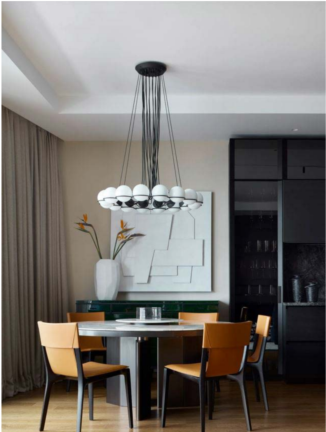
By the table, Minotti; leather chairs, Poltrona Frau; chandelier, Astep. The mural on the wall is the work of the author of the project.