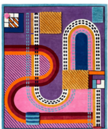
TR2176 Abstraction III.I