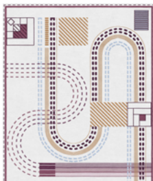
TR2177 Abstraction III.II