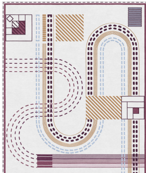
TR2177 Abstraction III.II