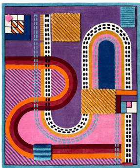
TR2176 Abstraction III.I