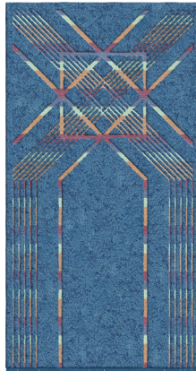
TR2006 Bali Wave