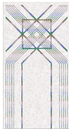
TR2005 Bali Sand