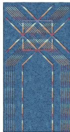
TR2006 Bali Wave