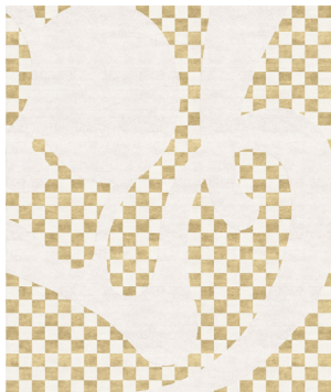
TR1434 Barcelona Chequers