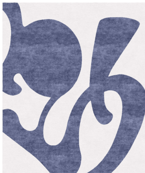
TR1507 Barcelona Royal Blue