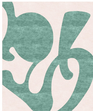
TR1769 Barcelona Green