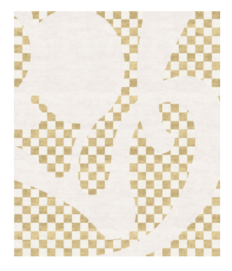
TR1434 Barcelona Chequers