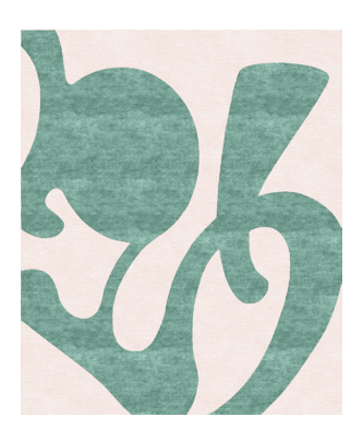
TR1769 Barcelona Green