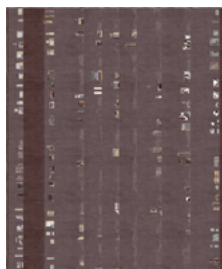
TR1437 Camarillo Fondant au Chocolat