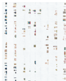
TR2109 Camarillo Blanc