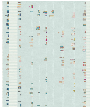
TR1432 Camarillo Bleu Ivoire