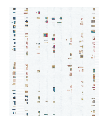
TR2109 Camarillo Blanc