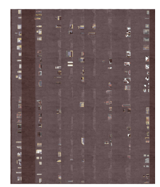
TR1437 Camarillo Fondant au Chocolat