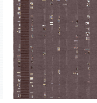
TR1437 Camarillo Fondant au Chocolat

TR2109 Camarillo Bleu Ivoire Camarillo Blanc