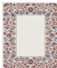
TR2242 Charlotte Cherry