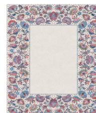
TR2243 Charlotte Indigo