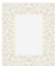
TR1356 Charlotte Blanc