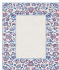
TR2241 Charlotte Aquamarine