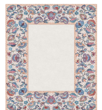
TR2244 Charlotte Peach