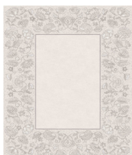
TR1355 Charlotte Terrestre