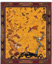
TR1523 Chinese Phoenix Antique Gold