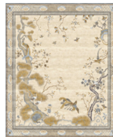
TR1365 Chinese Phoenix Celeste