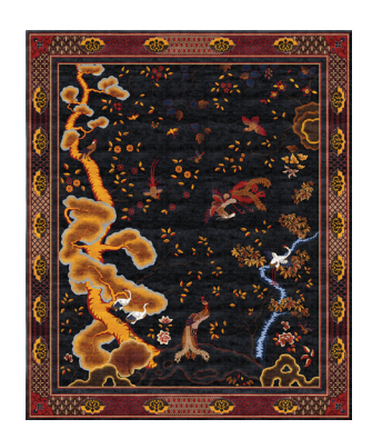
TR1524 Chinese Phoenix Antique Indigo