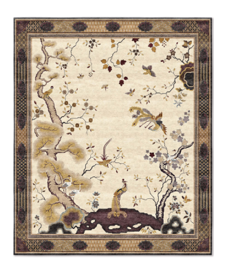
TR1364 Chinese Phoenix Bronze