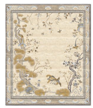
TR1365 Chinese Phoenix Celeste