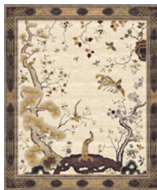
TR1364 Chinese Phoenix Bronze