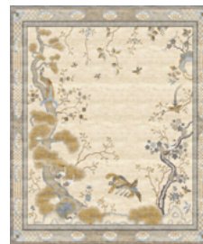
TR1365 Chinese Phoenix Celeste