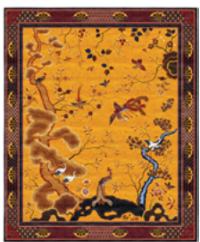
TR1523 Chinese Phoenix Antique Gold