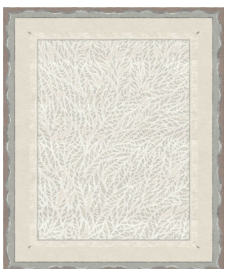
TR1359 Claudine Gris