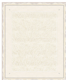
TR1358 Claudine Blanc