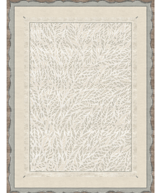
TR1257 Claudine Terrestre