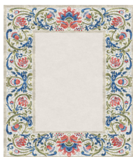
TR2237 Clementine Muse Coral