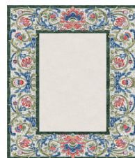
TR2238 Clementine Marsala Blue