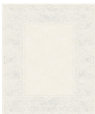
TR1360 Clementine Blanc