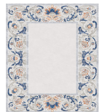
TR2240 Clementine Sage