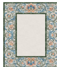
TR2239 Clementine Honey