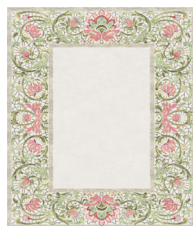
TR2236 Clementine Artishoke