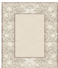
TR1362 Clementine Terrestre