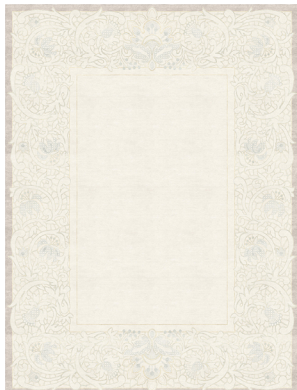
TR1361 Clementine Gris