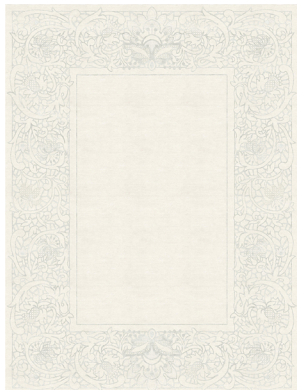
TR1360 Clementine Blanc