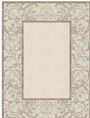
TR1362 Clementine Terrestre