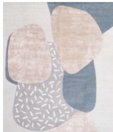
TR1745 Composition X.II