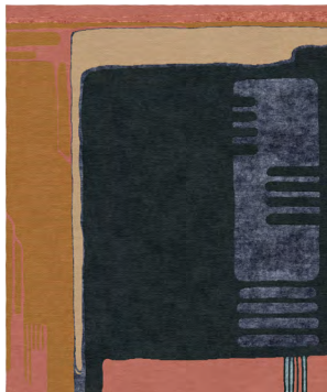
TR1748 Composition XIII.I