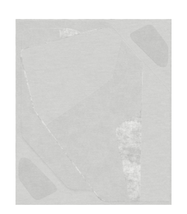
TR1766 Composition XV.II