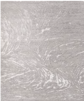
TR1353 Eight Grey