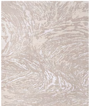
TR1351 Eight Beige