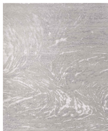
TR1353 Eight Grey