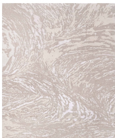
TR1351 Eight Beige