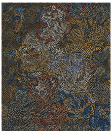
TR1587 Fiametta Giardino in Autunno