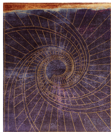
TR1238 Firenze Porpora