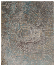
TR1245 Firenze Blu Notte