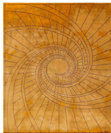
TR1239 Firenze Ruggine d'Oro