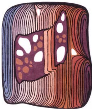
TR1972 Gamma Sud