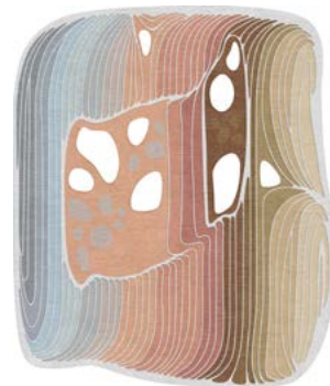
TR1974 Gamma Est