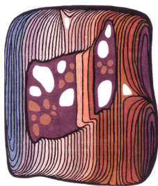
TR1972 Gamma Sud