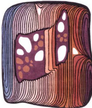
TR1972 Gamma Sud