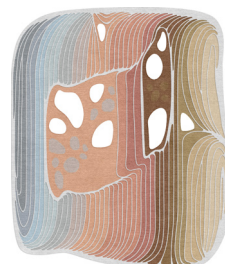
TR1974 Gamma Est