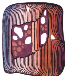
TR1972 Gamma Sud