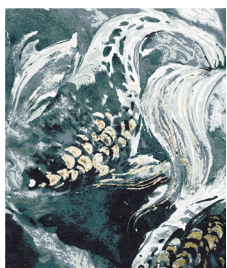
TR1017 Gold Fish