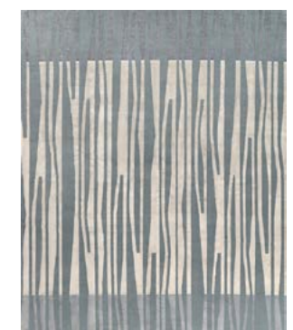
TR1387 La Chapelle De Nuit