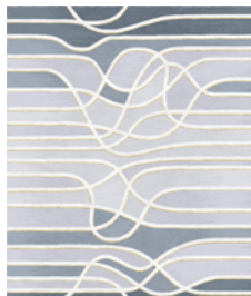
TR1180 La Seine Au Crepuscule