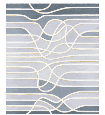
TR1180 La Seine Au Crepuscule