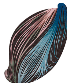
TR1970 Laser Mercury