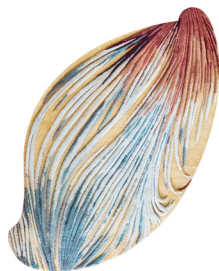
TR1968 Laser Venus