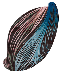
TR1970 Laser Mercury