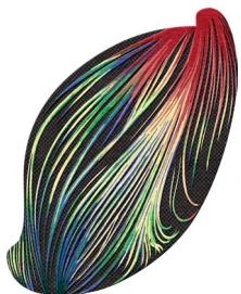
TR1966 Laser Sun