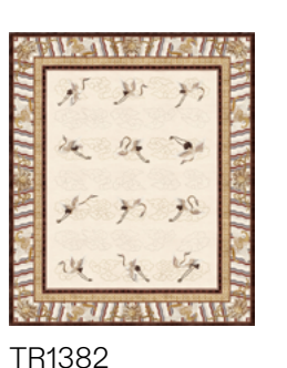
Manchurian Cranes Eggshell