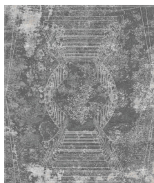
TR1244 Napoli Fumo