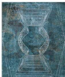
TR1243 Napoli Smeraldo