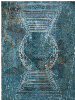
TR1243 Napoli Smeraldo