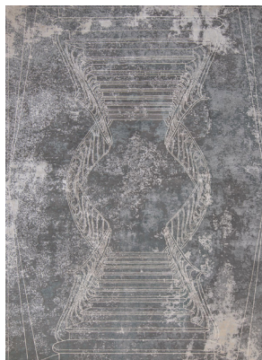
TR1244 Napoli Fumo