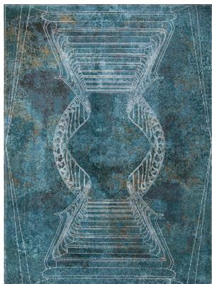
TR1243 Napoli Smeraldo