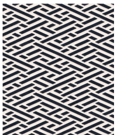
TR1957 Notturmo Nero