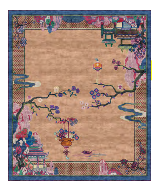
TR1444 Riverhouse Spring Garden