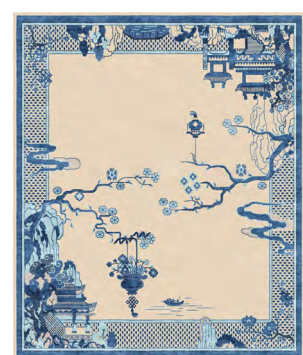
TR1536 Riverhouse Antique Sand