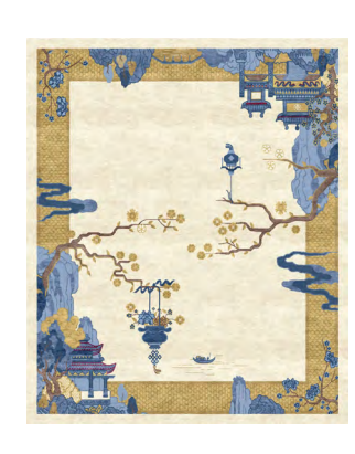
TR1445 Riverhouse Celeste Silky Weaving