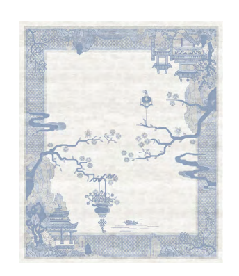
TR1446 Riverhouse Nebula Silky Weaving