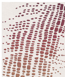
TR2008 Santorini Shade