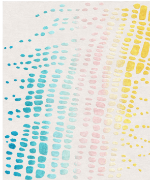
TR2009 Santorini Storm