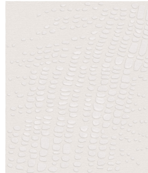
TR2010 Santorini Light