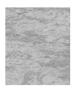
TR1350 Seven Grey