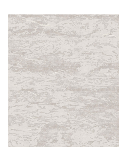
TR1348 Seven Beige