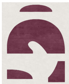
TR2031 Seychelles Sunset