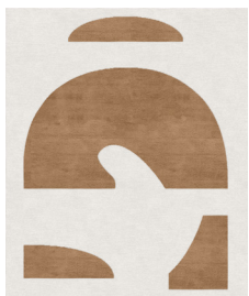
TR2029 Seychelles Morning