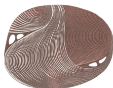
TR1976 Space Odity