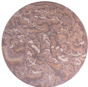
TR1396R Tempest Bronze