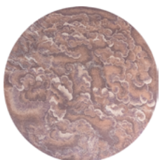
TR1396R Tempest Bronze